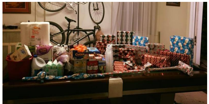
Gifts and food gathered at the West Side Estate before being donated to the Adopt a Family during Christmas.