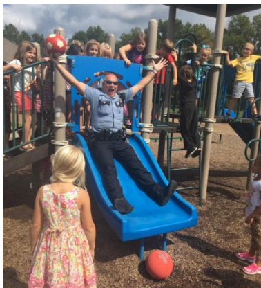
Skip keeping our local playgrounds safe

As best as I can figure, Skip (mostly) survived about 600 games, playing seven years at fullback and eight at scrumhalf. I had some big hits, one called shot, lots of kicks, played half-frozen and once seeing double. There were epic parties, a few good fights, lots of stitches, a few concussions, broken face, broken bones, dislocations, and thankfully lots of free beer. There were people falling off of floats, jumping off of balconies, lawsuits, scrumhalf bowling, halftime wedding, bar crawls the length of High Street, more than a few random arrests, awards banquets, halftime speeches, ugly red jerseys, the College Football Hall of Fame tourney, a West Virginia raffle, tornado, sunken houseboat, and Williebago trips. Given the chance, Skip wouldn't change a thing. Well, maybe the countless injuries, but the rest was awesome!