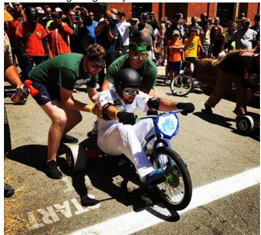
Team lining up at the starting line