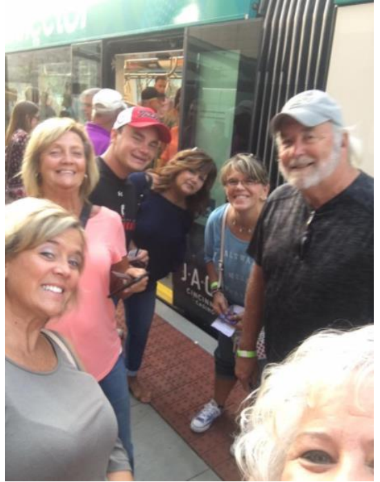
The Split the Pot winners took a photo outside the Streetcar before they ventured to Jack Casino

Keep your eyes and ears open for our Winter Streetcar Pub Crawl. We're hoping to beat last year's record of $1,800!